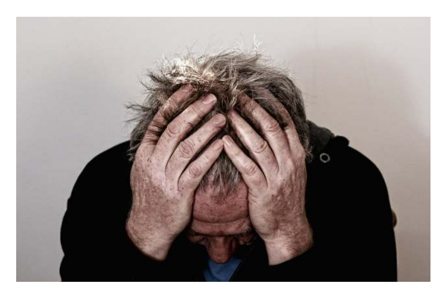
In My Opinion: One Reader's Experience

For those interested in the book and what I think, I offer the following review.